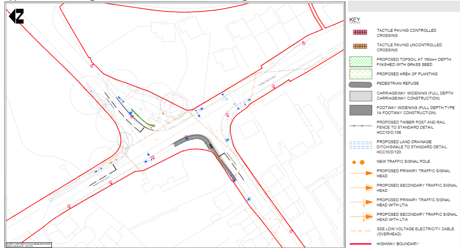
Appendix 2 – Nursling Street/ Horns Drove General Arrangement